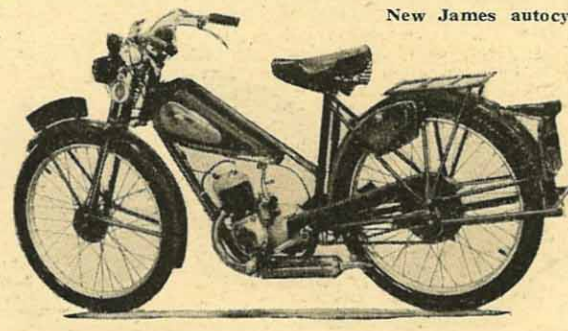
New James autocycle